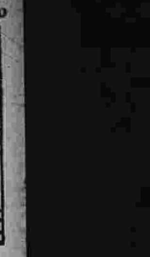
WITH MAJOR HOOPLE