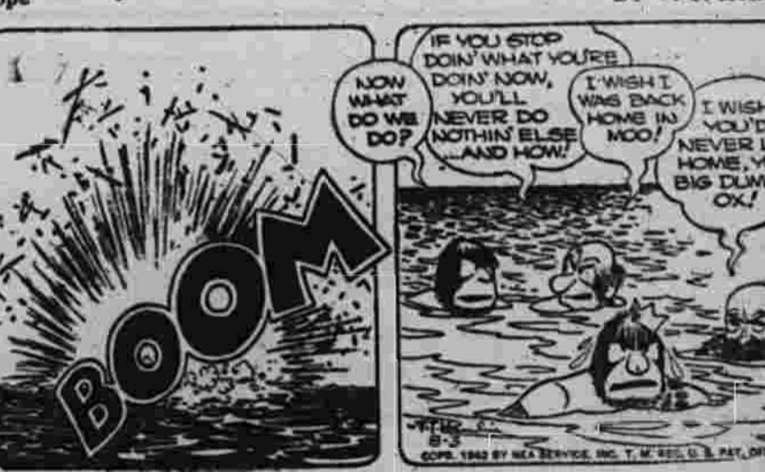
He Can Take a Hint