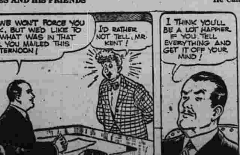
FRECKLES AND HIS FRIENDS