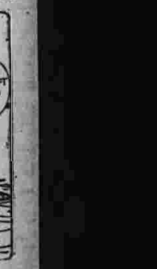
BY MERRILL BLOSSER